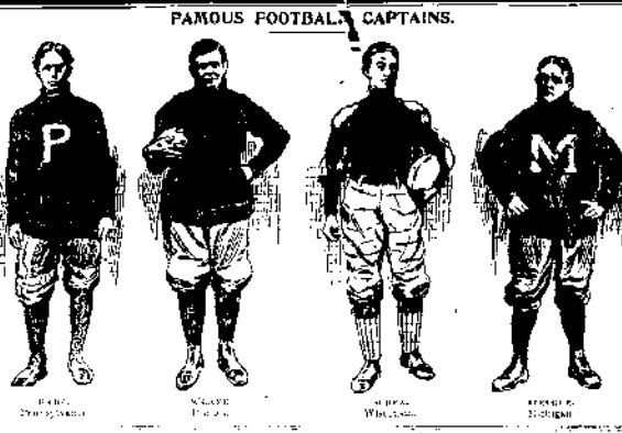
FAMOUS FOOTBALL CAPTAINS

Without Friction. A party of young men had been visiting a young lady who was very well known for her beauty and grace. They were all very much interested in her, and she was very much interested in them. They were all very much interested in her, and she was very much interested in them. They were all very much interested in her, and she was very much interested in them. They were all very much interested in her, and she was very much interested in them.