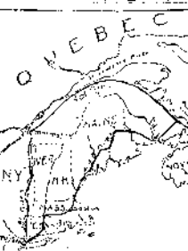
HOW TO SAVE YOUR HAYS ON RAILROAD MATTERS.